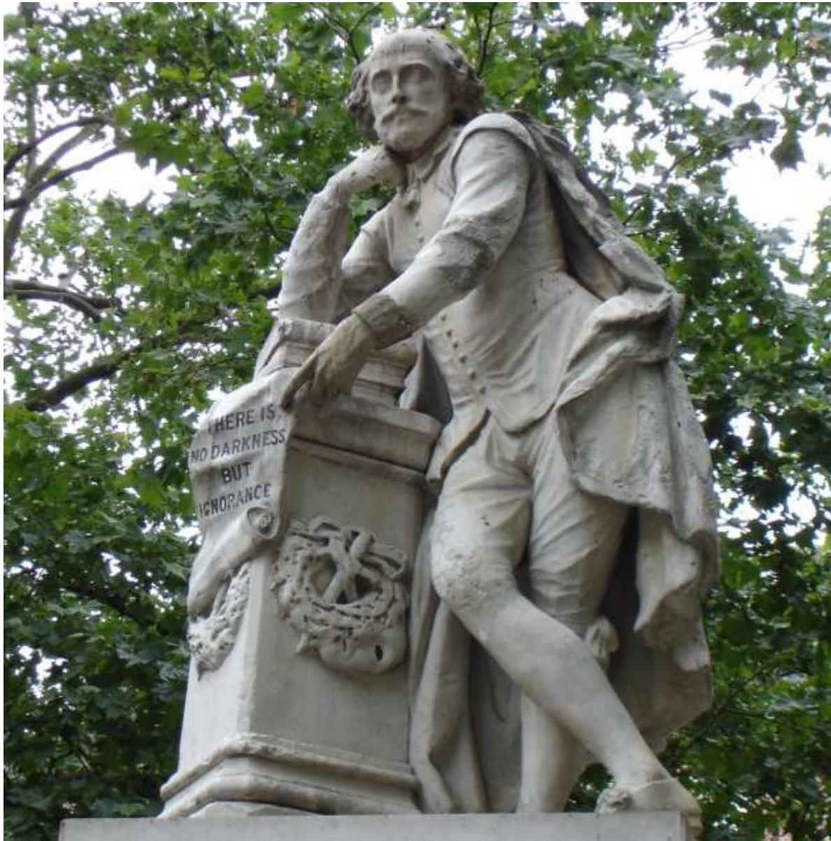
William Shakespeare statue - Leicester Square 19th century statue in the middle of the square

Leicester Square is the centre of London's cinema land, and one of the signs marking the Square bears the legend "Theatreland". It is claimed that the Square contains the cinema with the largest screen and the cinema with the most seats (over 1600). The square is the prime location in London for world leading film premières and has seen blockbusters including Harry Potter and James Bond film series, Avatar, Alice in Wonderland, and animation films such as Shrek; and co-hosts the London Film Festival each year. Similar to Grauman's Chinese Theatre in Hollywood, the square is surrounded by floor mounted plaques with film stars names and cast handprints.